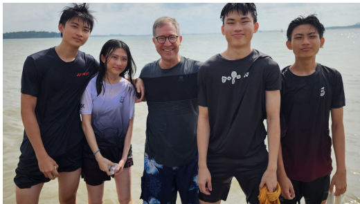
Top: Farewell party held at OMF headquarters; Bottom: Baptisms at Changi Beach