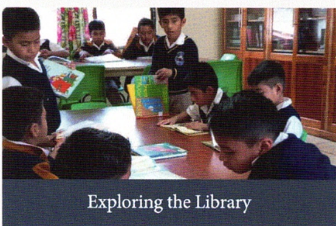
Exploring the Library

As far as our farm is concerned, it is still very sad. The river continues to rage across our land. Demolition of the destroyed buildings has begun. People ask what our plan is for the farm. We are waiting to see what happens once the river calms down from the rains in the mountains. We do not know what we will be able to do. As Jehoshaphat told the Lord in II Chronicles 20:12, "...neither know we what to do: but our eyes are upon thee." This land belongs to the Lord. He will show us what His will is in His time.