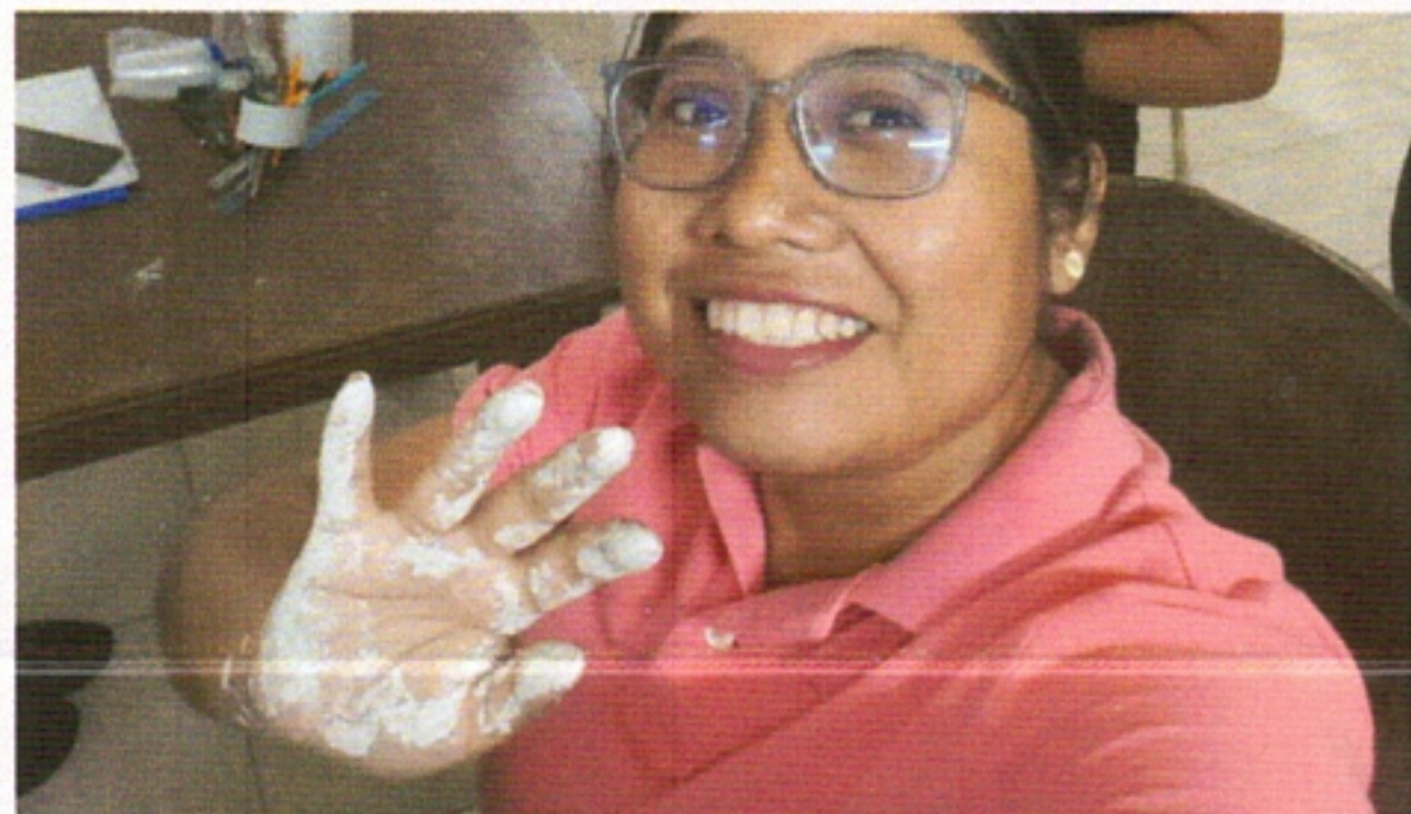
Even more Painting