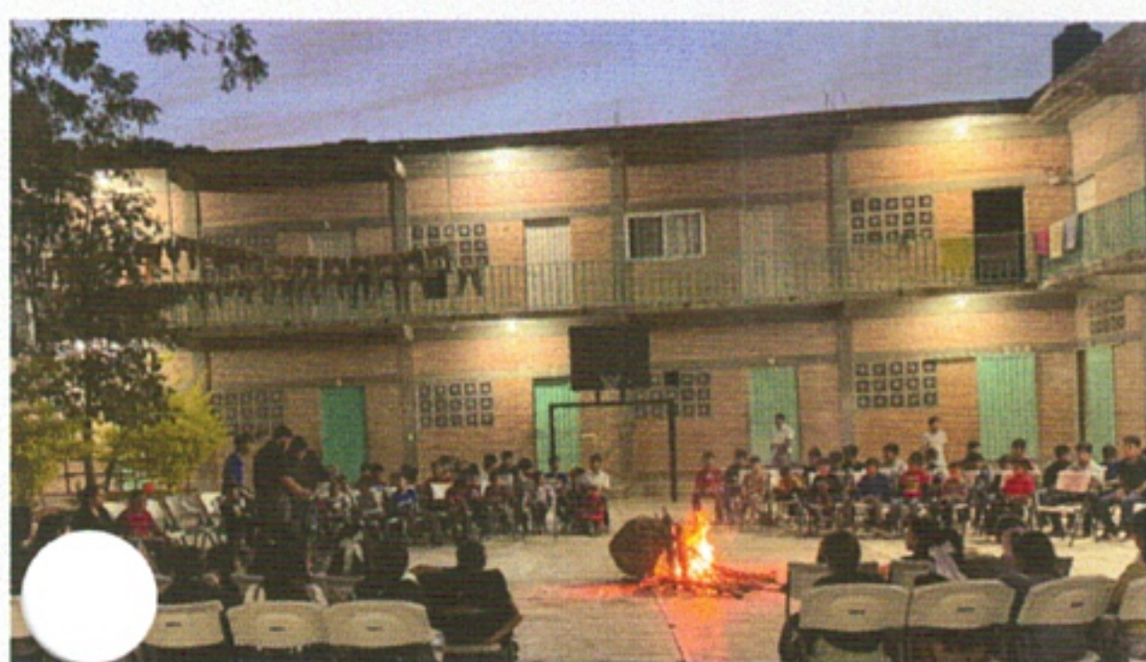
Celebration of Life