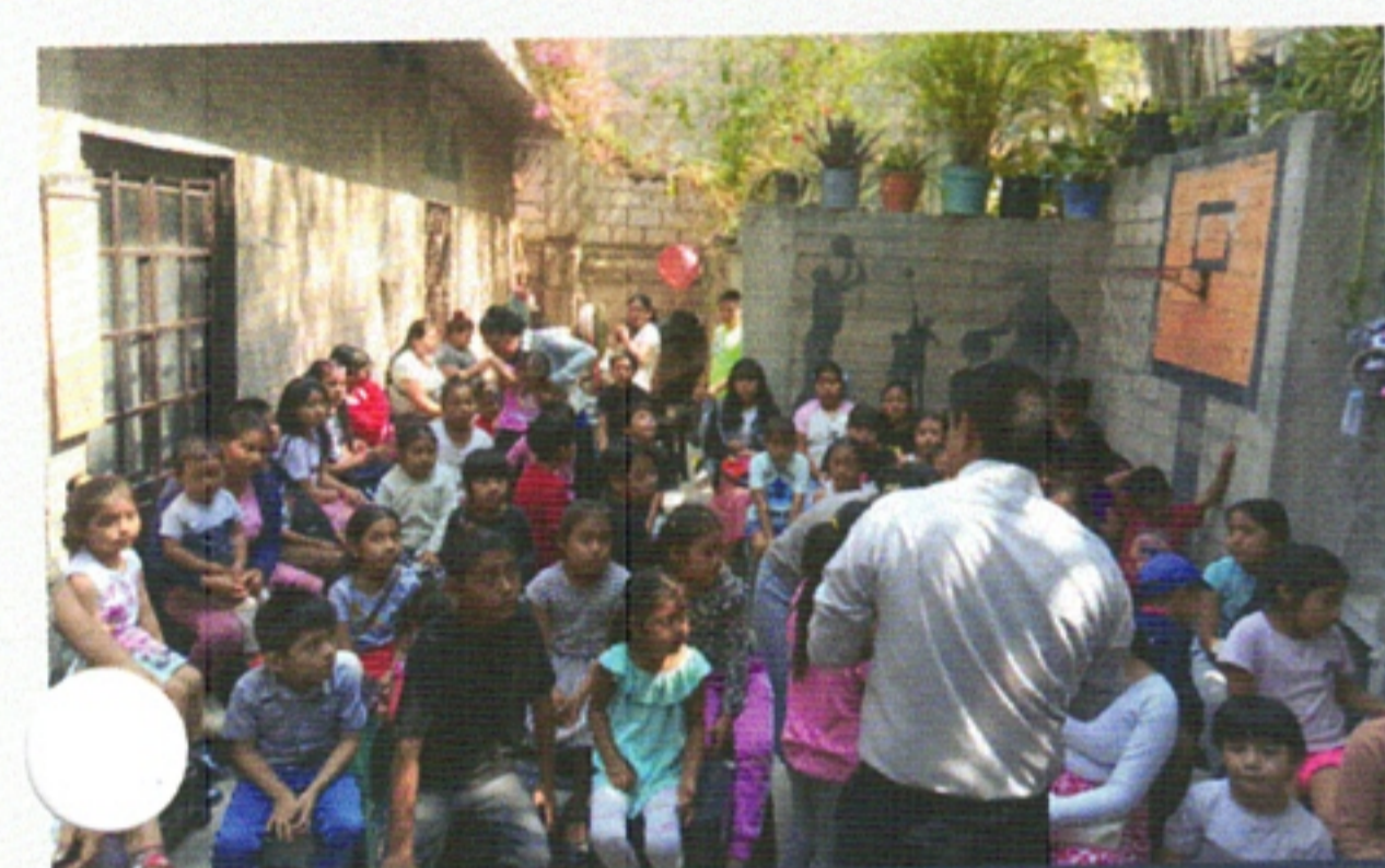
Children's Day Bible Club

Mexico celebrates many holidays the US does not celebrate. The month of May is especially full of them. May 1 was Labor Day, May 3 is Bricklayers' Day, May 5 is the memorial for the Battle of Puebla, May 10 is Mother's Day, May 15 is Teachers' Day, May 23 is Students' Day, and so on. To the left you will see a cute picture of some of our smallest children dressed up to commemorate the holidays celebrated only this week.