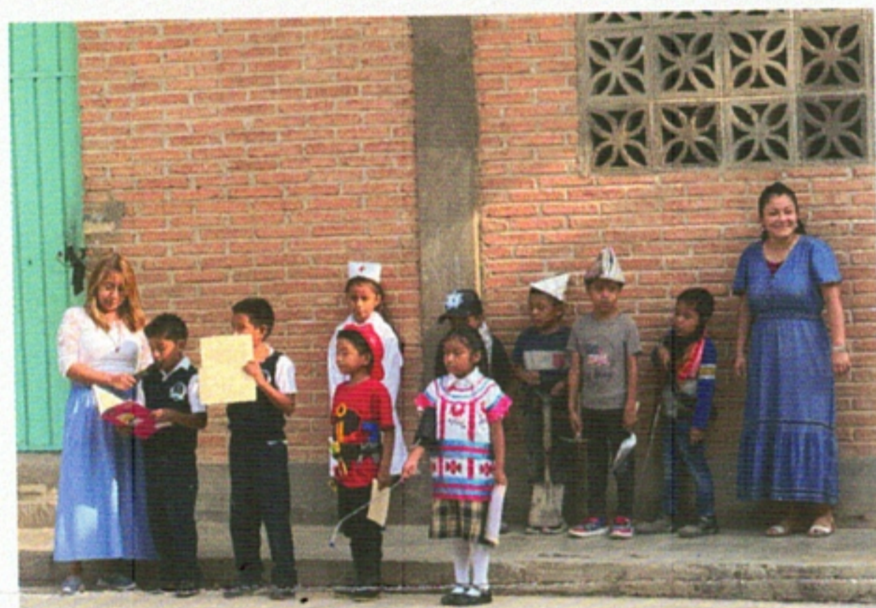
Dressed up for May Holidays